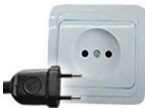
Type C socket